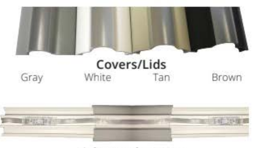
Light Track Covers (Custom Colors Available; Minimum Quantity Required)